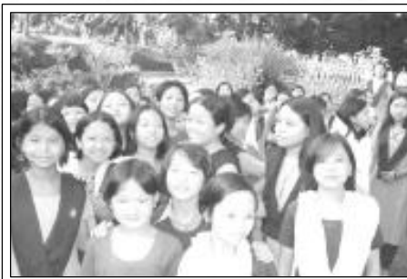
Children of Immortal Bliss – Happiness reflects the care and concern they get in VKVs